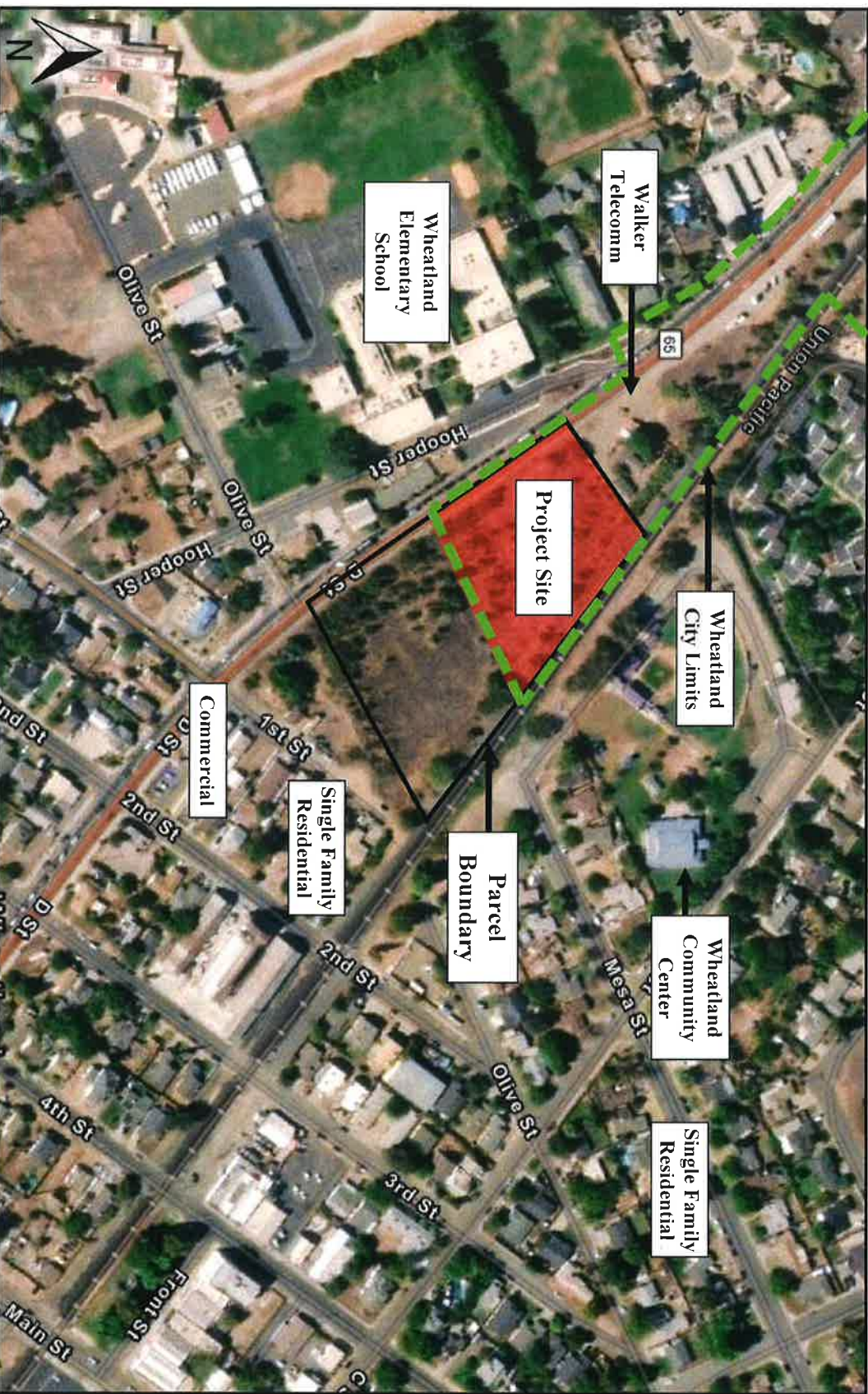
Figure 2 <mark>Proj</mark>ect Site Boundaries Map

*Project site boundaries are approximate.