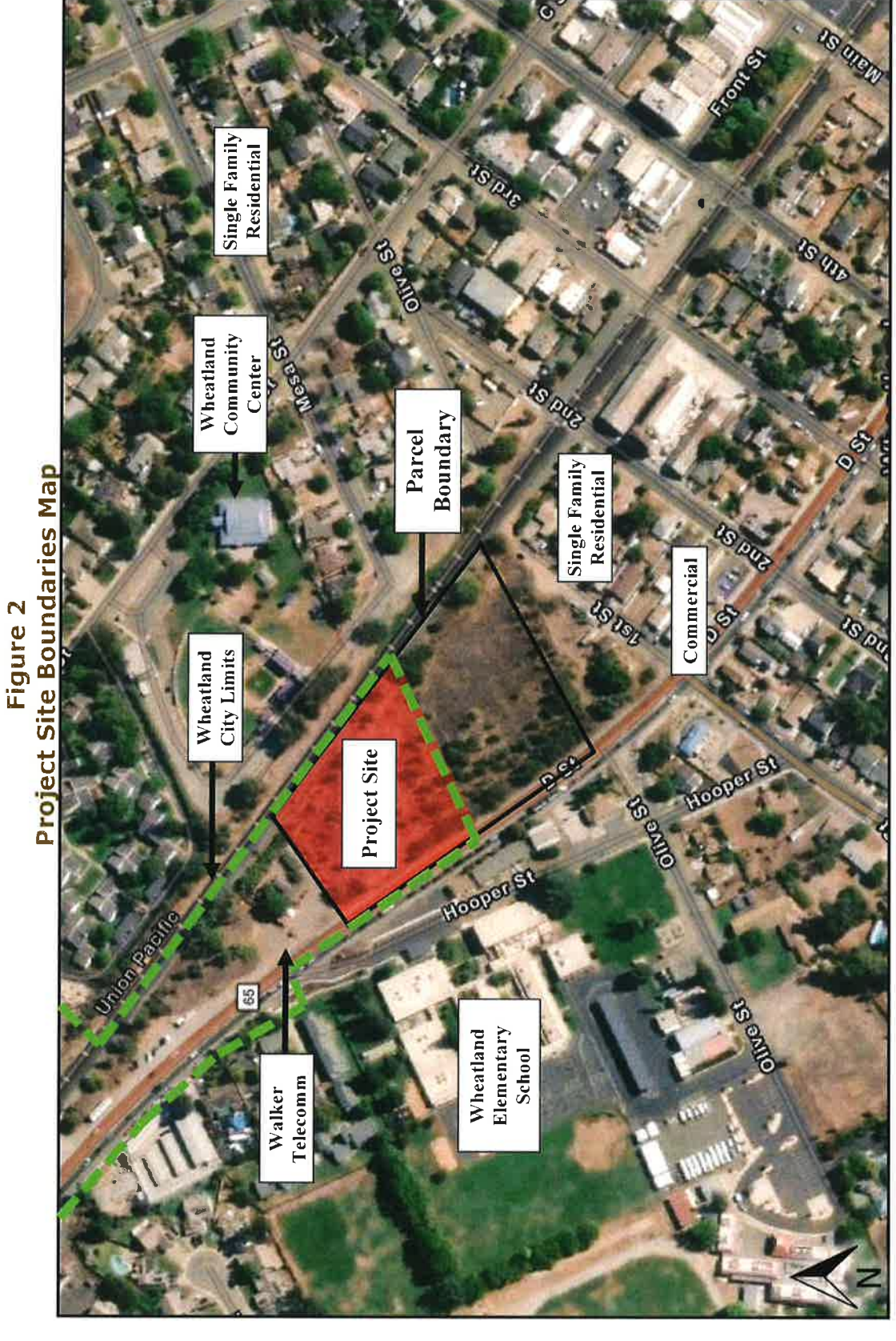
*Project site boundaries are approximate.