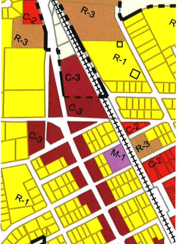
Proposed Zoning Map