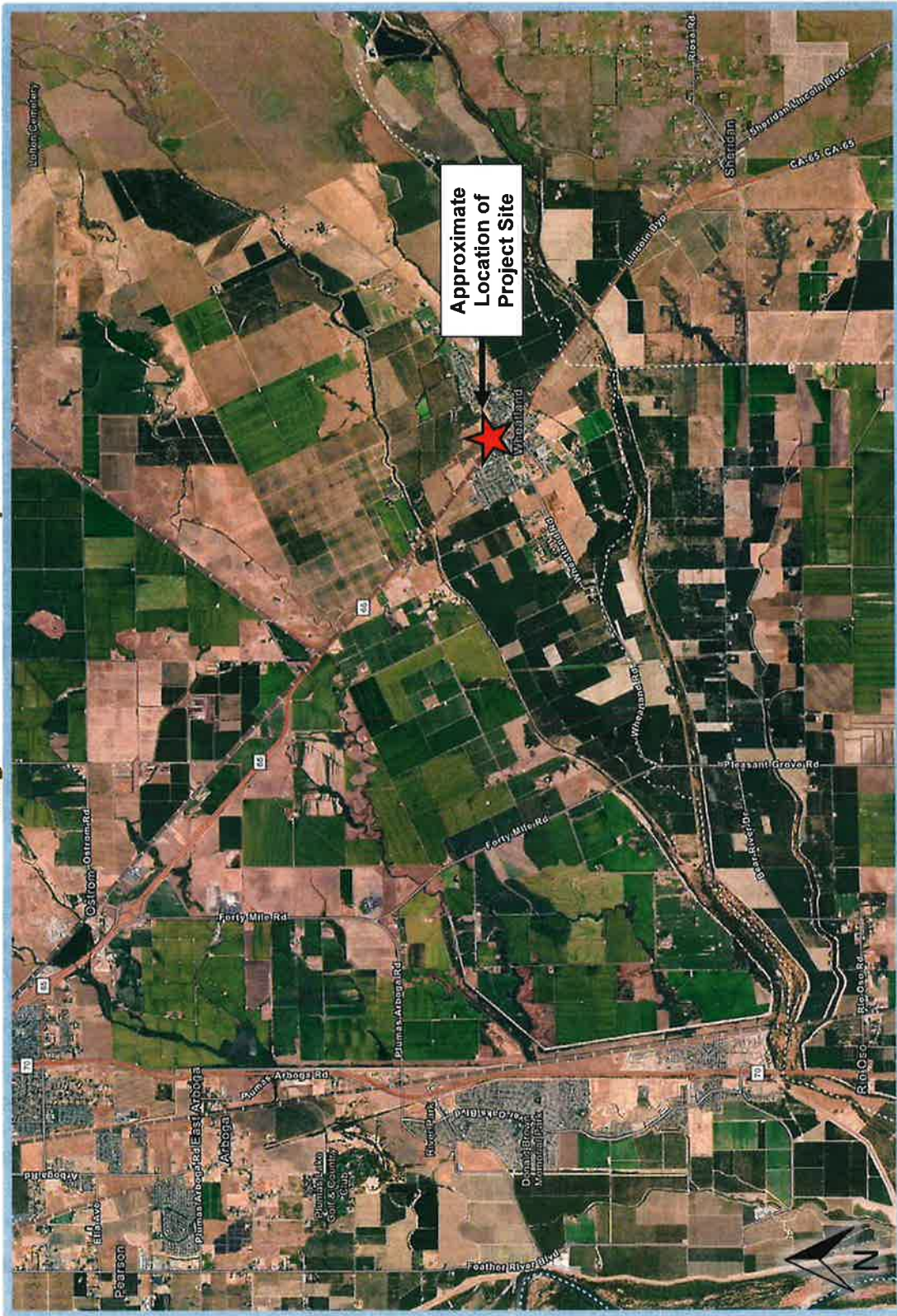
Figure 1 Regional Location Map