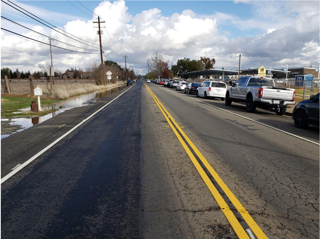
Figure 1 - Wheatland Rd. looking East. Note gravel shoulder, driveway and mailbox on the left.

The existing road right-of-way is 60-feet wide. The terrain is flat with a few lateral obstructions within the road right-of-way, most notably mailboxes and an overhead electric utility line running along the northerly shoulder. There is a notable grade difference at the westerly end of the Site between the edge of pavement and the gravel shoulder that could make it difficult for parked vehicles accessing the road shoulder. In the rainy season stormwater runoff ponds in portions of the northerly shoulder that deters drivers from parking in flooded areas.