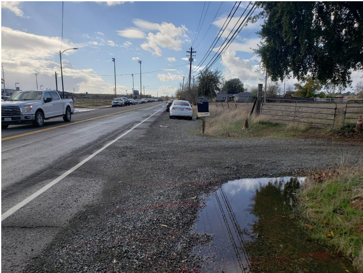
Figure 2 - Wheatland Rd. looking west. Note gravel shoulder, driveway, and mailbox on the right.

The posted speed limit is 25-miles per hour and the segment is an established and marked school zone. Traffic controls include a double yellow centerline, white edge line (fog line) stripes, and No Parking signs along the northerly shoulder for the length of the Site. Just beyond the limits of the Site are school zone signs, a marked mid-block yellow crosswalk near G Street, signs and pavement markings denoting the crosswalk, and school zone signs and pavement markings. The No Parking signs appear to date back to when the County was responsible for the roadway as evidenced by an old No Parking sign with a county road mile-marker on the post (presumably prior to the City's annexation of the rural properties north of the Site). The other No Parking signs appear to be newer signs installed on metal posts within the last 10-years.